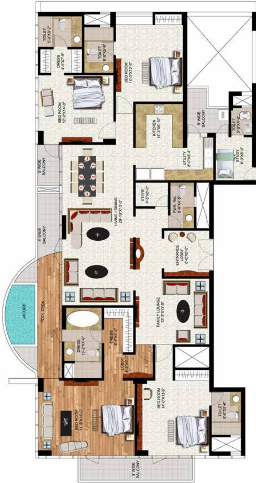
Key Plan Tower T-1 4Bed + 4Toilet + Study +Family