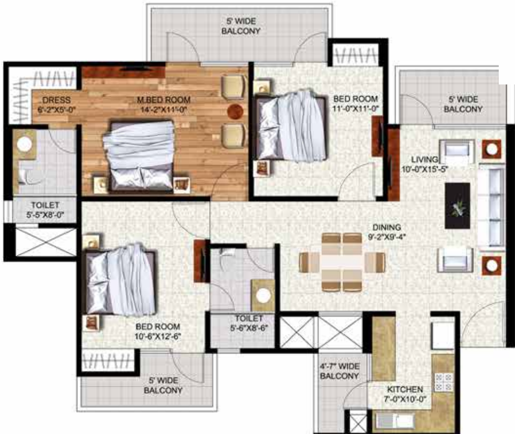
Key Plan TowerT-2, T-3 & T-4 3Bed + 2 Toilet