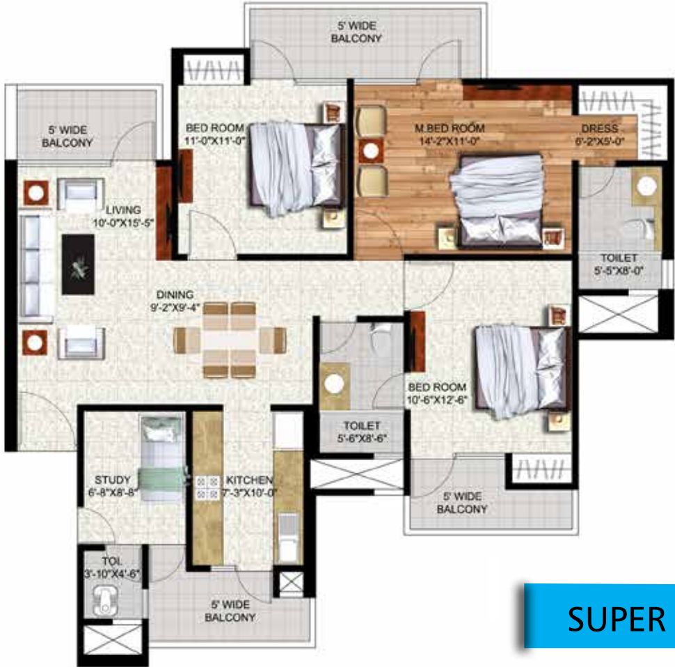
Key PlanTower T-2, T-3 & T-4, 3Bed + 3 Toilet + Study