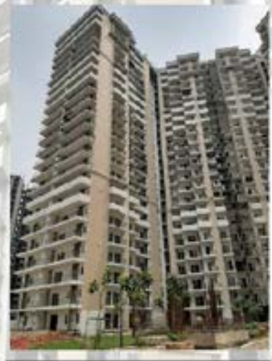
TOWER A-3 REAR