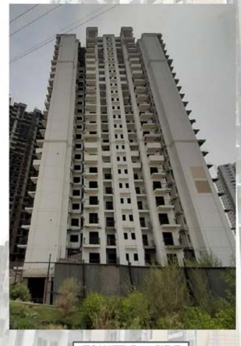
TOWER B-6 SIDE