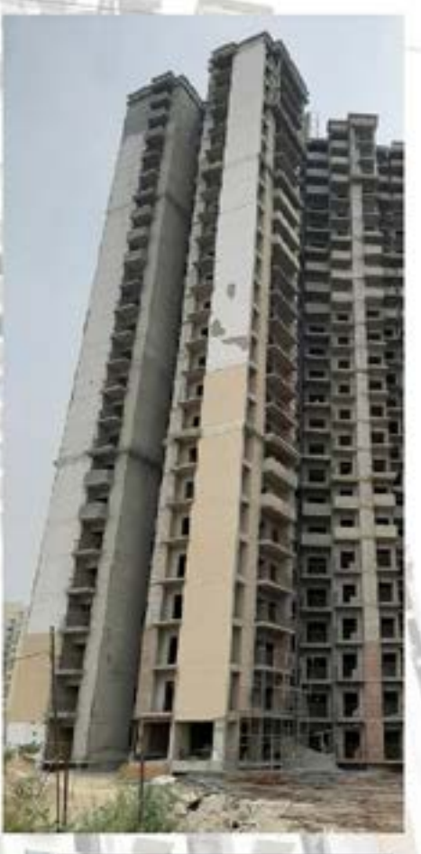
TOWER B-6 NON TOWER AREA