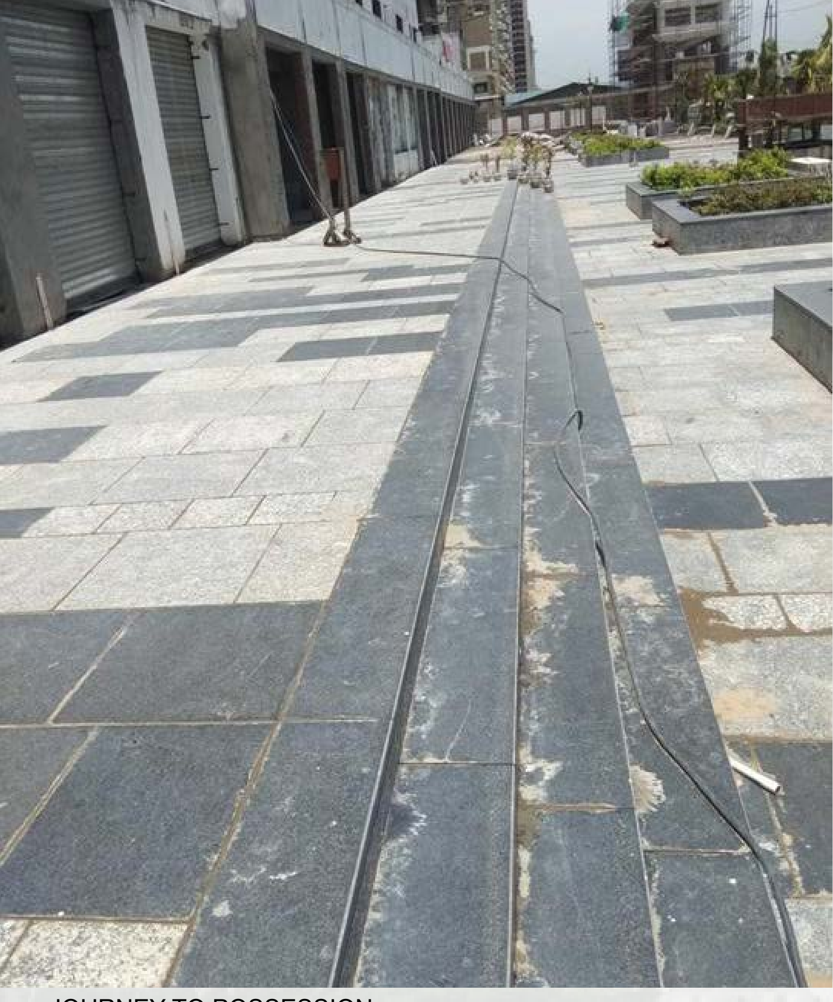
JOURNEY TO POSSESSION