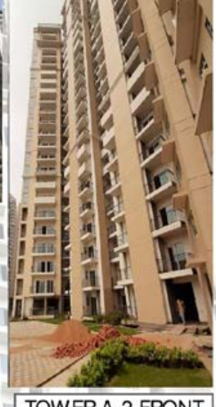
TOWER A-2 FRONT