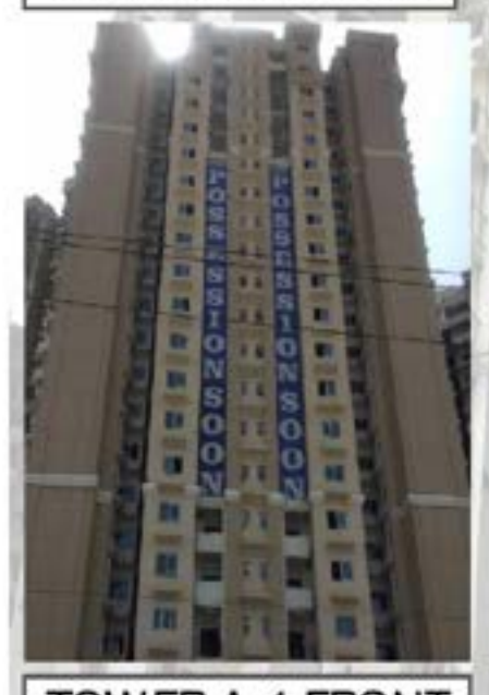
TOWER A-4 FRONT