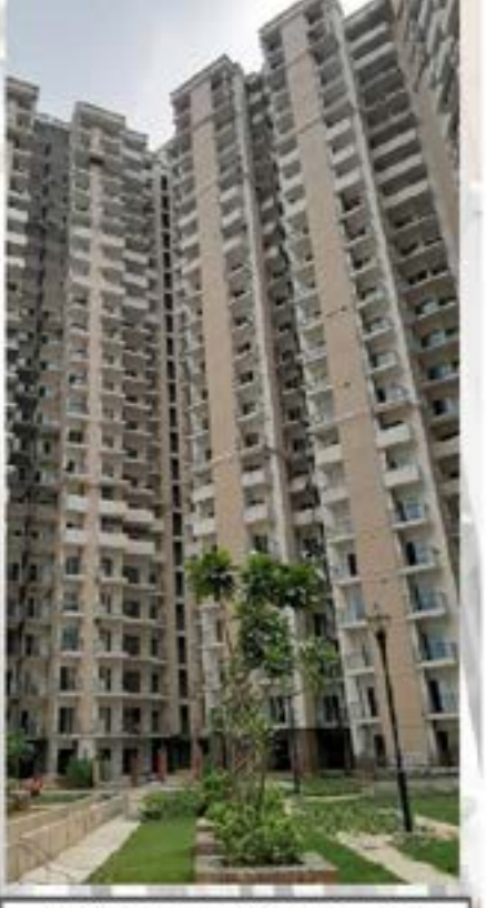
TOWER A-2 REAR