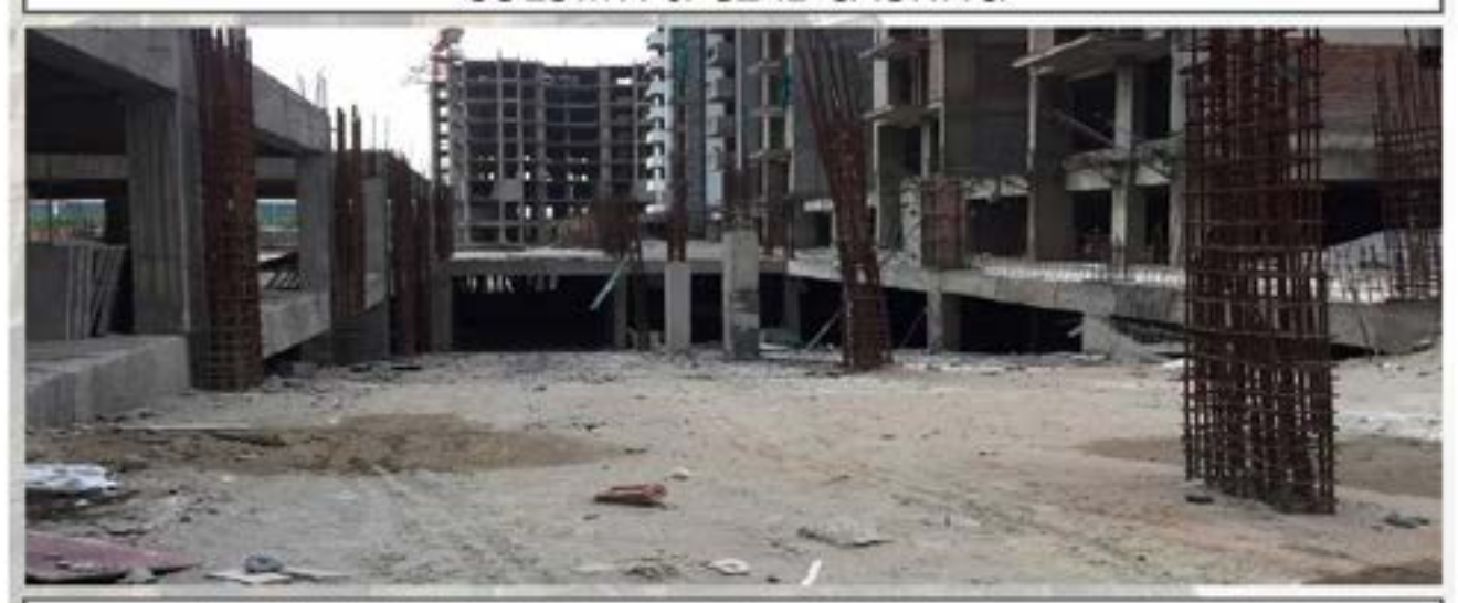
RAM P WITH NON TOWER BETWEEN TOWER-T6 & TOWER-T7