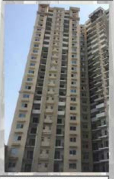
TOWER A-4 SIDE