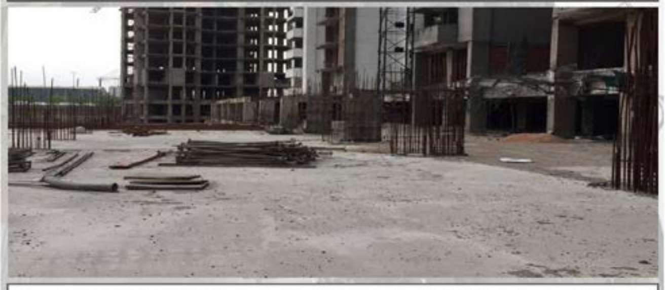
TOWER T-4 TO T-6 REAR SIDE NON TOWER CENTRAL AREA