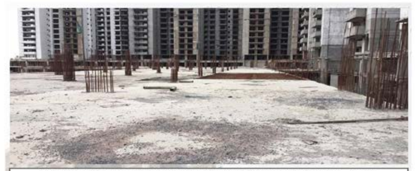
T-4 TO T-6 REAR SIDE NON TOWER TOWER CENTRAL AREA COLUMN & SLAB CASTING