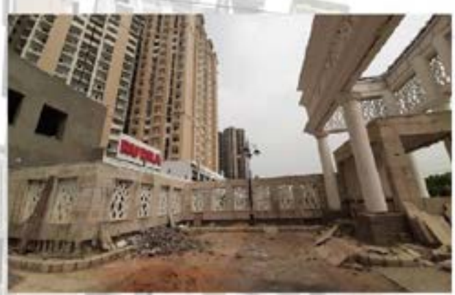
FRONT MAIN ENTRANCE GATE CONSTRUCTION ON PROGRESS