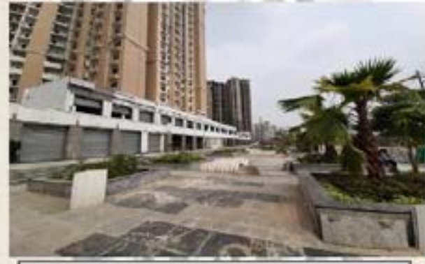
COMMERCIAL SHOPS SIDE