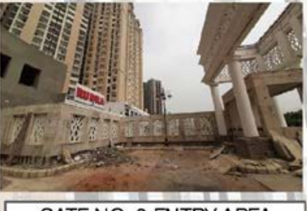
GATE NO. 2 ENTRY AREA