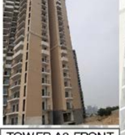
TOWER A3 FRONT