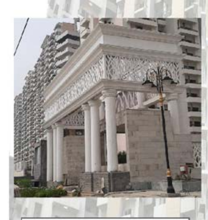
GATE NO. 2