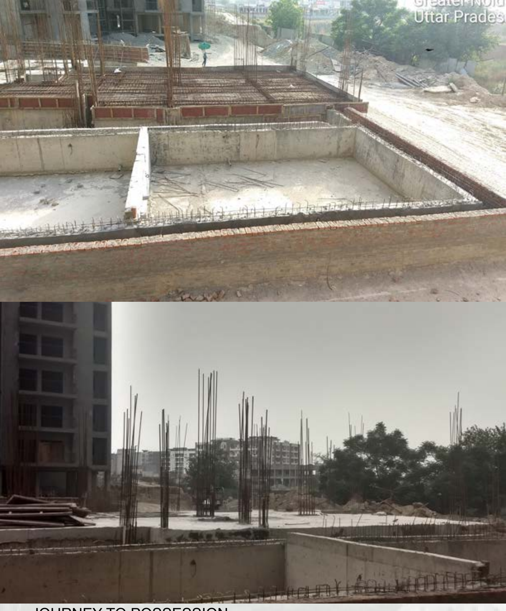
JOURNEY TO POSSESSION