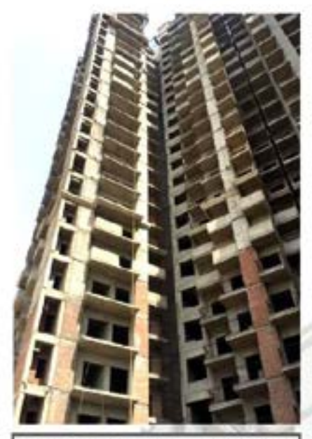
TOWER B-4 FRONT