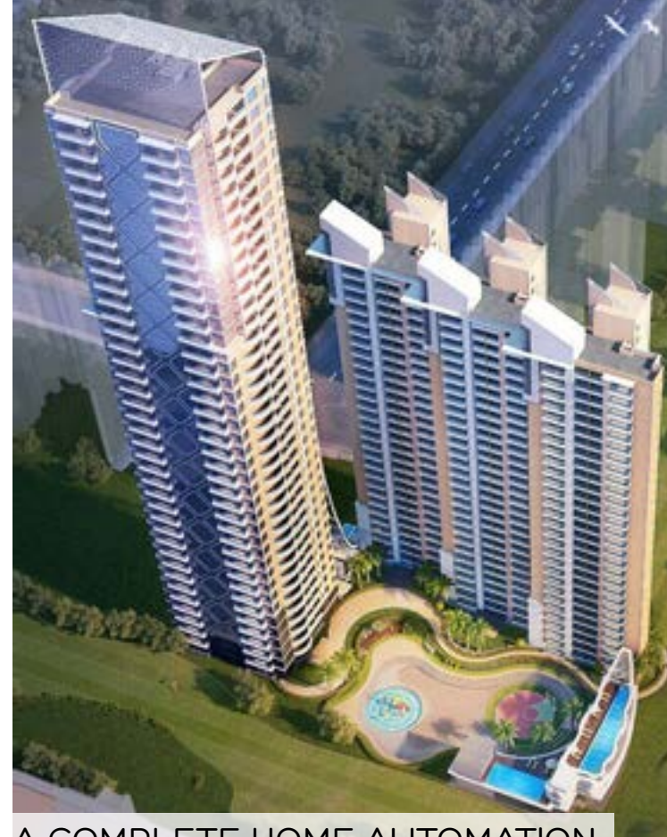
A COMPLETE HOME AUTOMATION