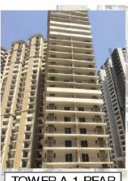
TOWER A-1 REAR