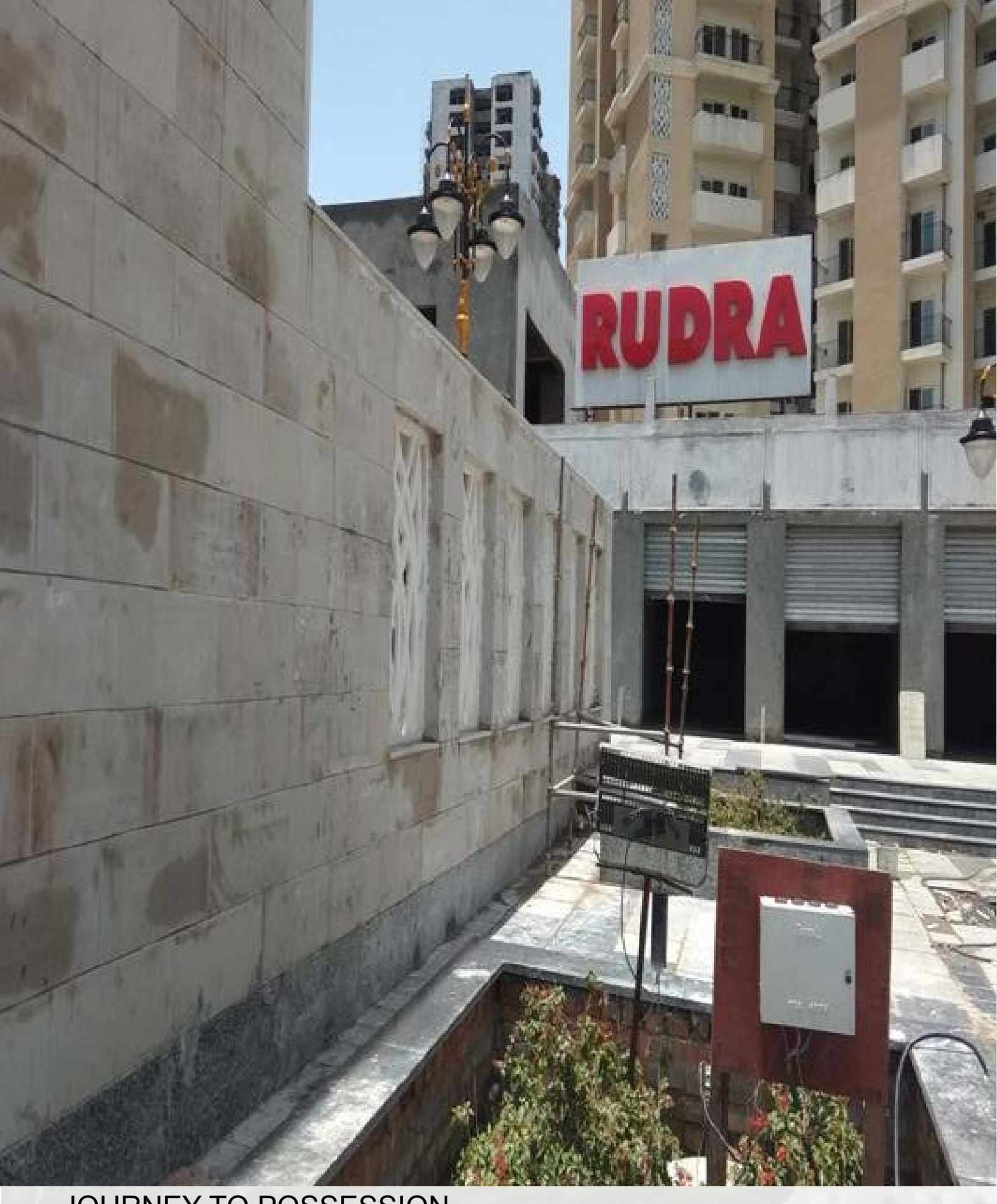
JOURNEY TO POSSESSION