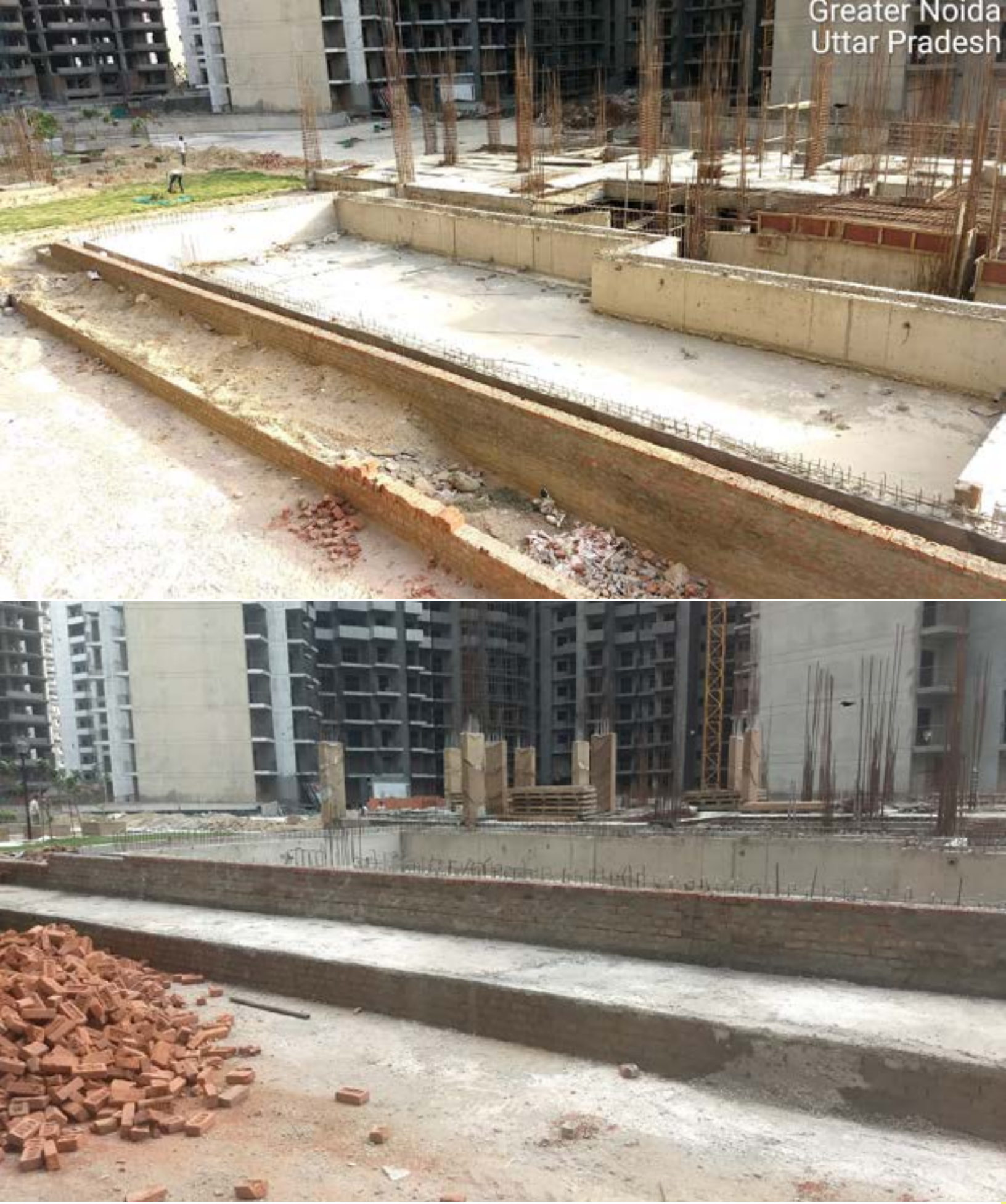
JOURNEY TO POSSESSION