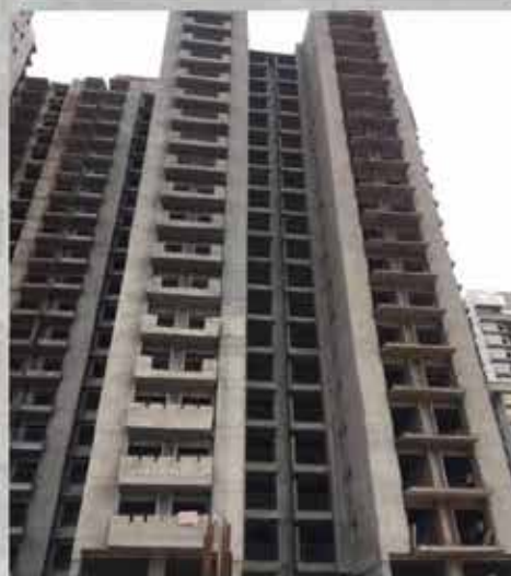
TOWER T-9 REAR