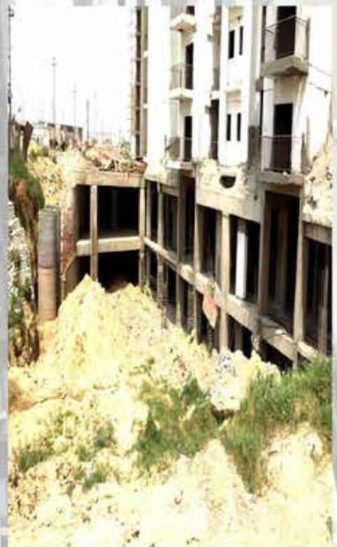
TOWER B-6 NON TOWER AREA