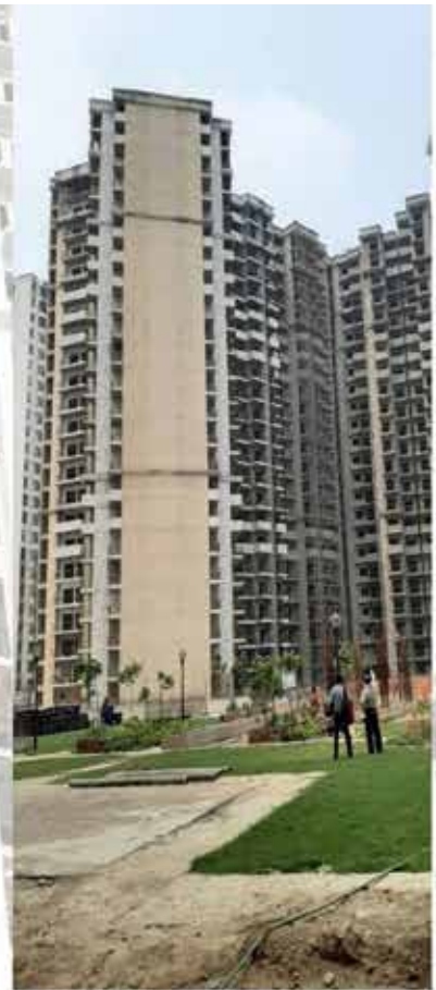
TOWER B-1 SIDE