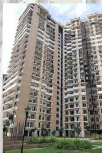
TOWER A-3 REAR