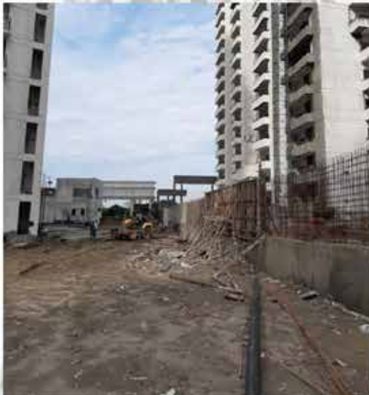
SERVICES NEAR A-1