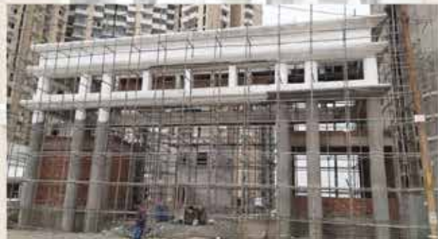
FRONT GATE NO. 1