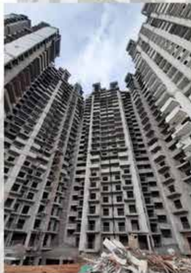
TOWER B-3 FRONT