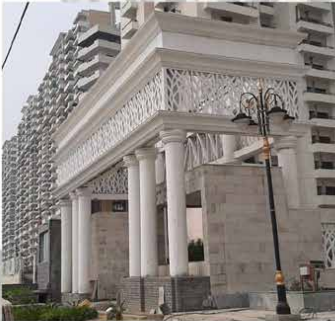
GATE NO. 2