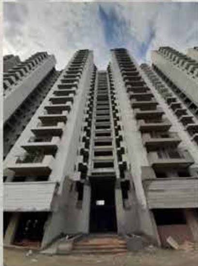
TOWER T-5 FRONT