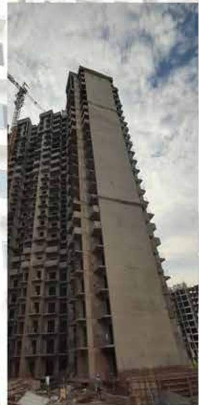
TOWER B-4 REAR