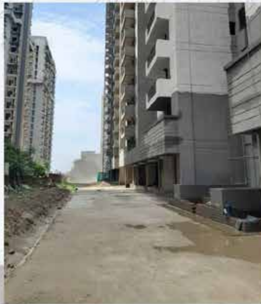
TOWER T-7 TO T-9 NONTOWER AREA