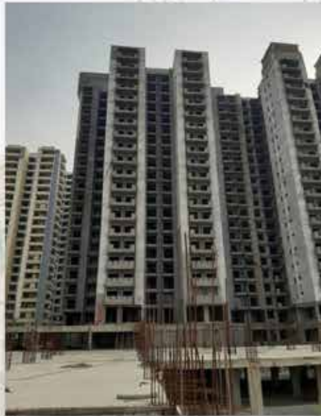
TOWER T-7 REAR