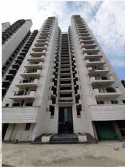
TOWER T-4 FRONT