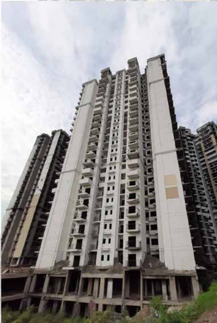
TOWER B-6 SIDE