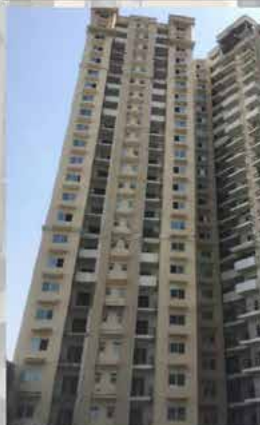
TOWER A-4 SIDE