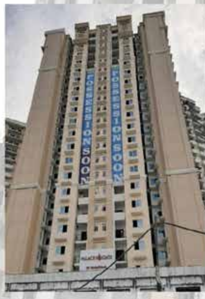
TOWER A-4 FRONT