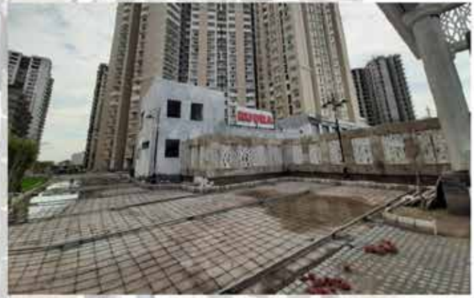
FRONT MAIN ENTRANCE GATE CONSTRUCTION ON PROGRESS