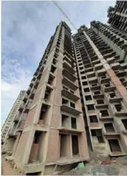
TOWER B-4 FRONT