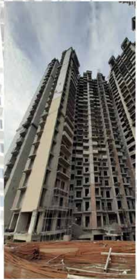
TOWER B-5 SIDE