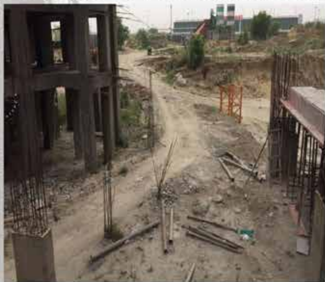
T-11 NONTOWER AREA