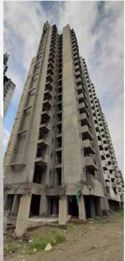
TOWER T-6 SIDE