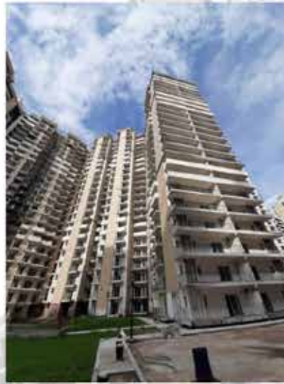
TOWER A-1 REAR