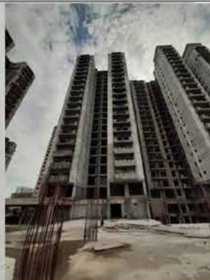
TOWER T-7 TO T9 REAR SIDE NON TOWER CENTRAL AREA