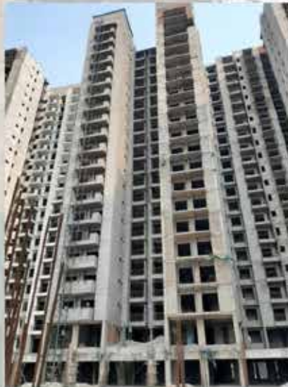
TOWER T-5 REAR