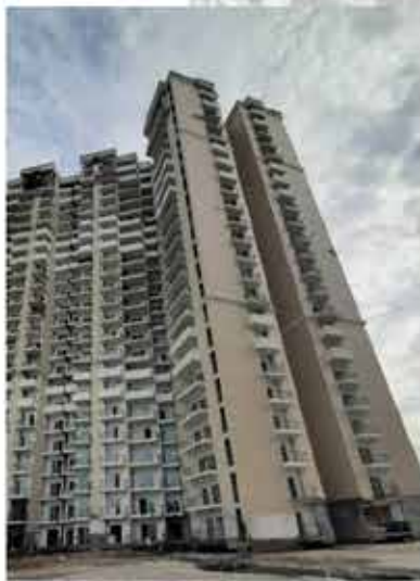
TOWER A-3 FRONT