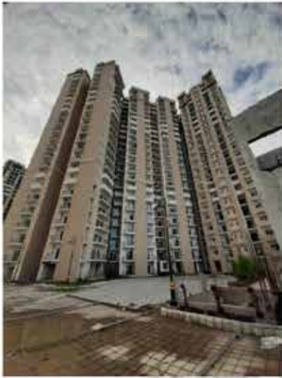
TOWER A-1, A-2 & A-4