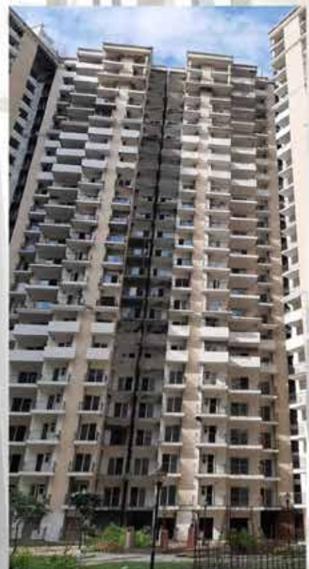
TOWER A-2 REAR