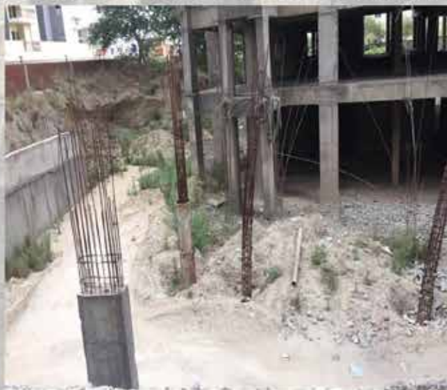
T-10 NONTOWER AREA