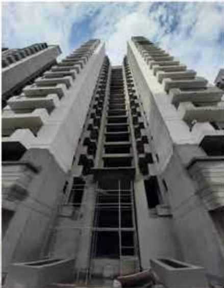
TOWER T-7 FRONT