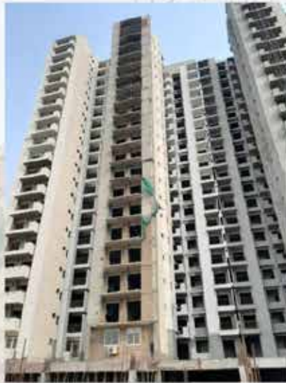
TOWER T-4 REAR