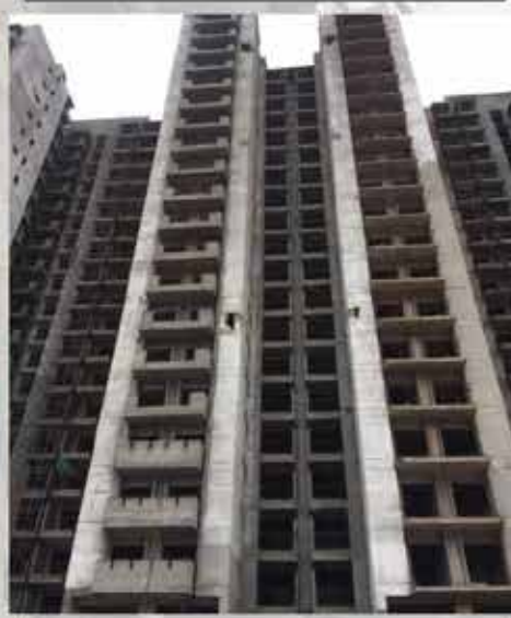
TOWER T-8 REAR