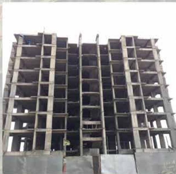
TOWER T-18 FRONT