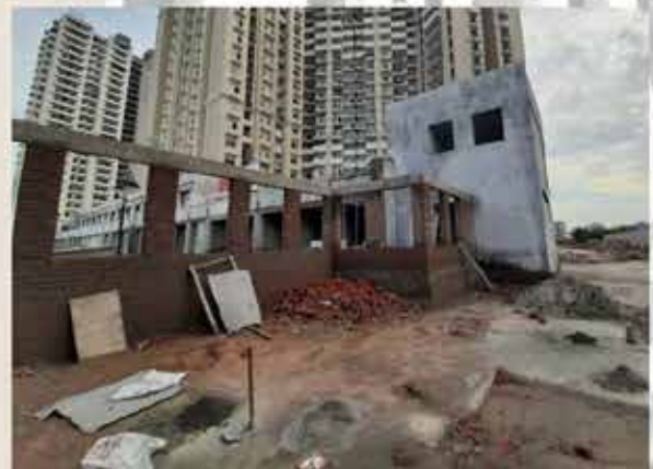
GATE NO. 1 ENTRY AREA