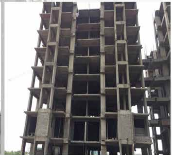
TOWER T-3 FRONT