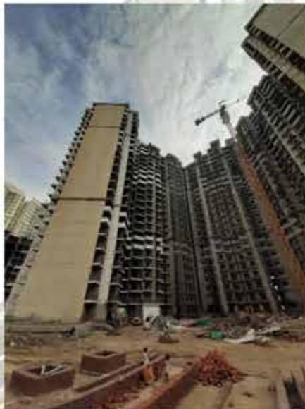
TOWER B-1 REAR