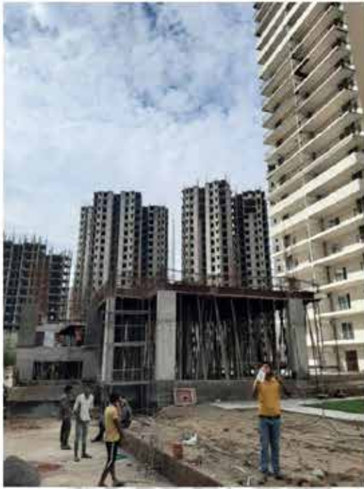
CLUB GROUND FLOOR