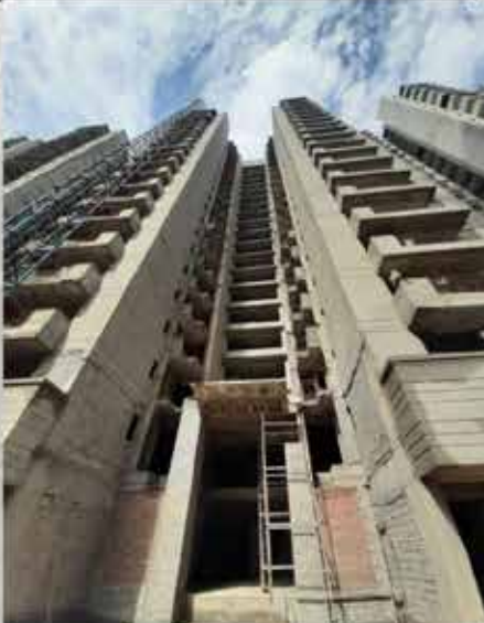
TOWER T-8 FRONT