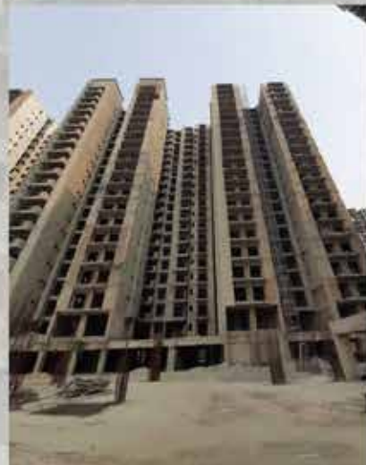
TOWER T-6 REAR

02-Aug-2018 at 5:17:27 44" 11, 77° 27' 3" Greater N