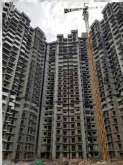
TOWER B-2 REAR