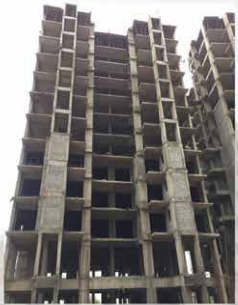
TOWER T-10 FRONT