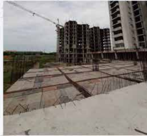
T-4 TO T-6 REAR SIDE NON TOWER TOWER CENTRAL AREA