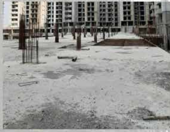
T-7 TO T-9 REAR SIDE NON TOWER CENTRAL AREA