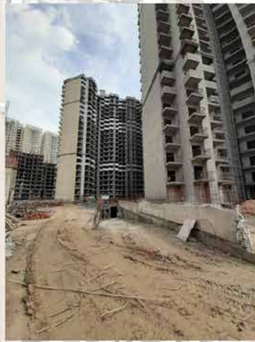
B-4 SIDE RAMP