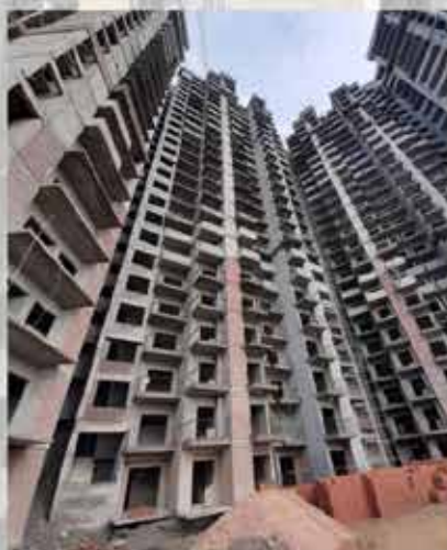
TOWER B-3 REAR