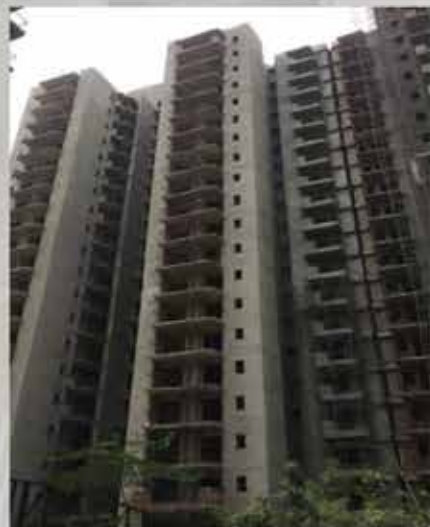
TOWER T-9 FRONT