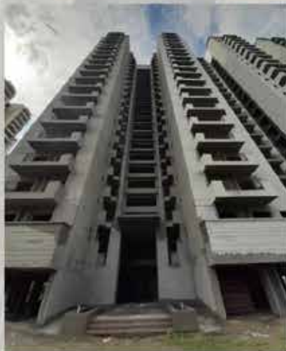
TOWER T-6 FRONT