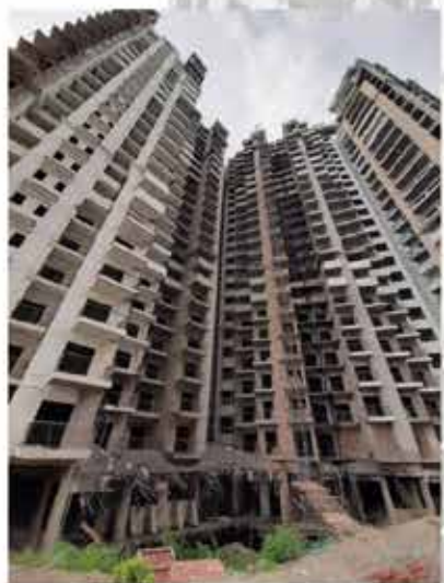
TOWER B-2 FRONT