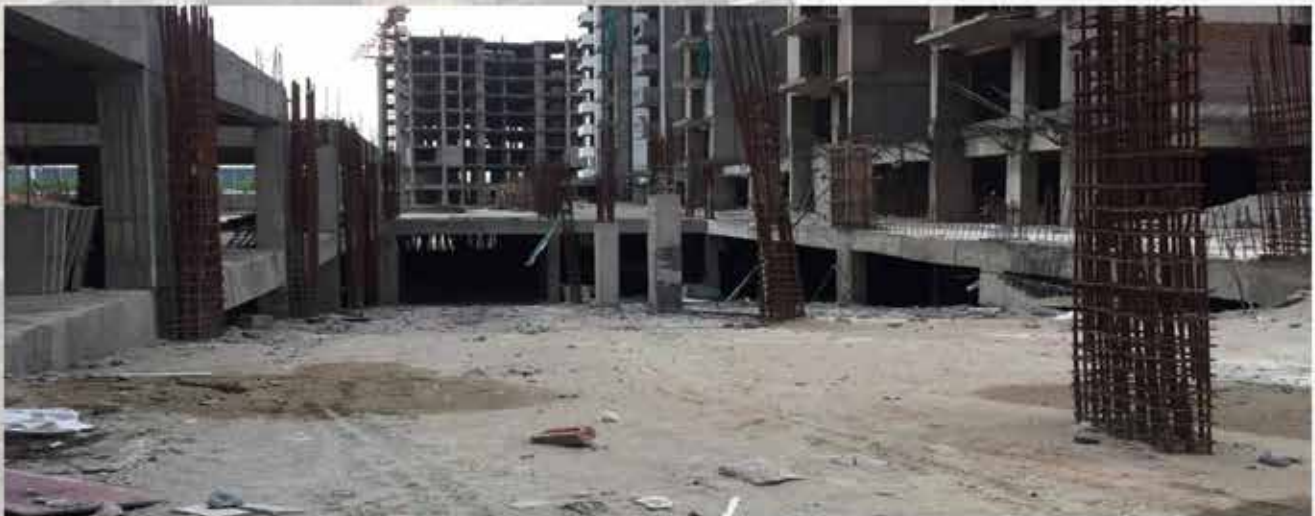
RAMP WITH NON TOWER BETWEEN TOWER-T6 & TOWER-T7