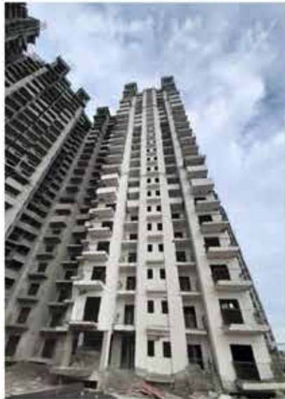
TOWER B-1 FRONT