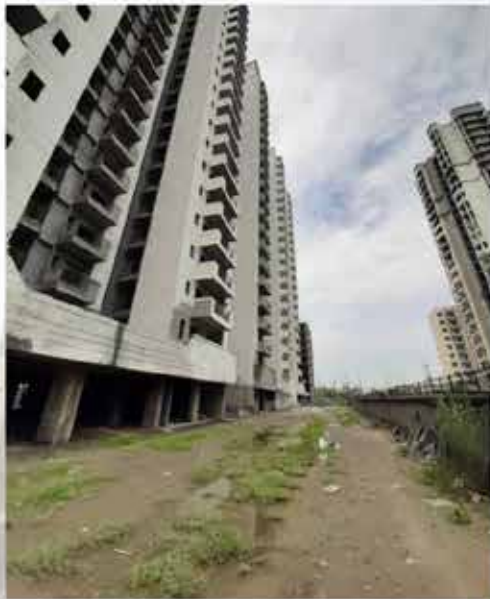
TOWER T-6 TO T-4 NONTOWER AREA